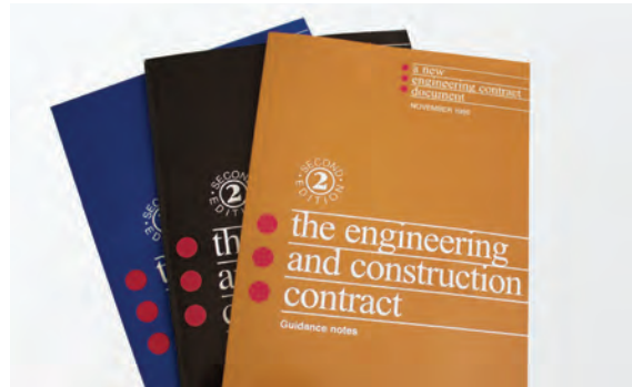
The New Engineering and Construction Contracts 2

By this time Sir Michael Latham had already started his review of contractual practices in