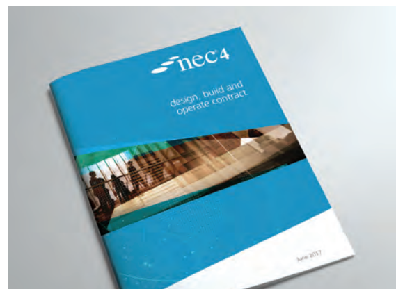
NEC4 Design, Build and Operate Contract

With the new NEC4 Design Build Operate Contract (DBO) and NEC4 Alliance Contract (ALC), the next decade could well see NEC becoming the world's favourite procurement suite.