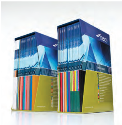
NEC3 box set

Stimulus to good management is also at the heart of NEC contracts. All newly emerging risks and problems must be flagged as soon as they become apparent through early warnings, ensuring 'no surprises'. These are then discussed at a risk-reduction meeting and resolved through agreed compensation events as work progresses, rather being swept under the carpet for a later