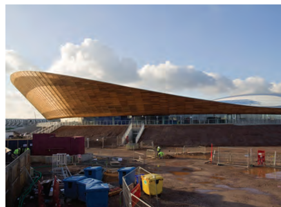
Lee Valley VeloPark

NEC3 was well received by the construction industry and usage continued to grow, particularly in the building sector. Its application was further extended with the NEC3 Term Service Short Contract (TSSC) in 2008 and the innovative NEC3 Supply Contract (SC) and NEC3 Supply Short Contract (SCC) in 2010, covering the buying of all types of plant, equipment and materials. After its widely recognised success in delivering the £7 billion of venues and infrastructure for London 2012 on time and within budget, the NEC3 suite received a general update on its 20th anniversary in 2013. A new NEC3 Professional Service Short