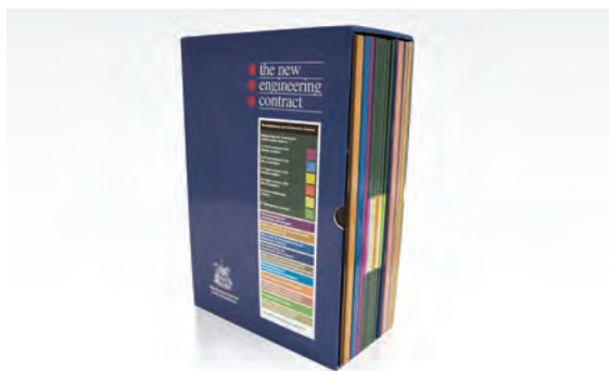
The New Engineering Contract

After five years of drafting and reviewing a consultative draft was finally published in 1991. It took two more years to digest the responses, after which ICE finally approved the 'New Engineering Contract' (NEC) and its back-to-back subcontract for publication in 1993.