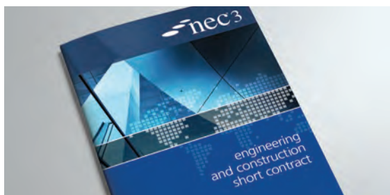
NEC3 Engineering and Construction Short Contract